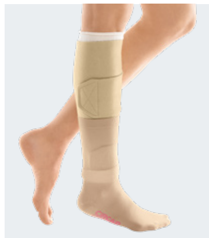
circaid juxtalite with circaid compression ankle