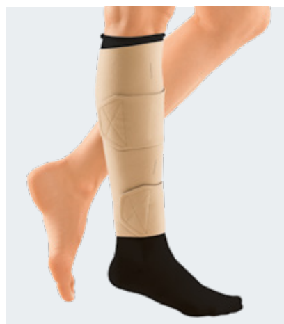
circaid juxtalite with circaid compressive undersock